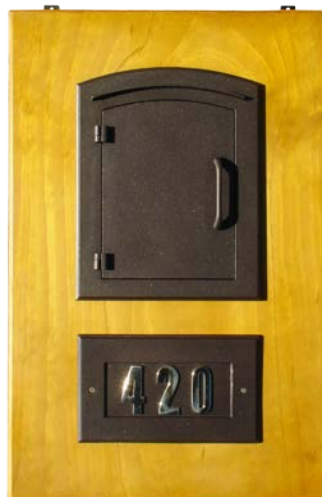
Manchester Wall Display (#DISP-MAN-W)