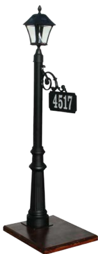
Single Post Floor Display (#DISP-SPF)