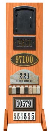
Freestanding Floor Display (#DISP-COMBO-F)