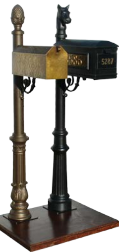
Double Post Floor Display (#DISP-DPF)