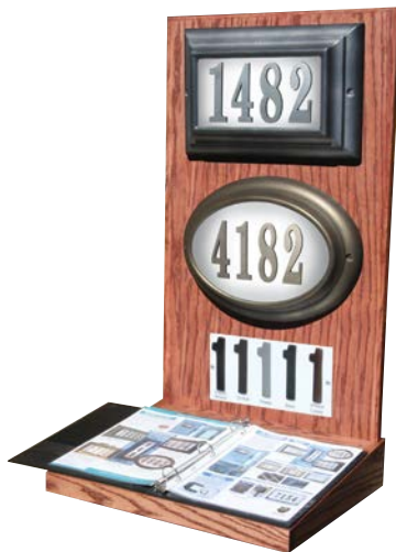
Edgewood Counter Display (#DISP-ED-C)