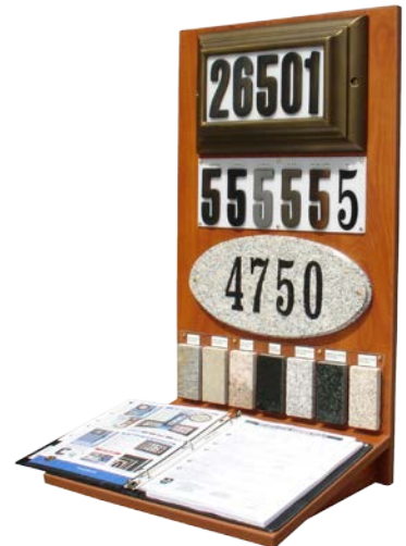
Edgewood/Granite Counter Display (#DISP-COMBO-C)