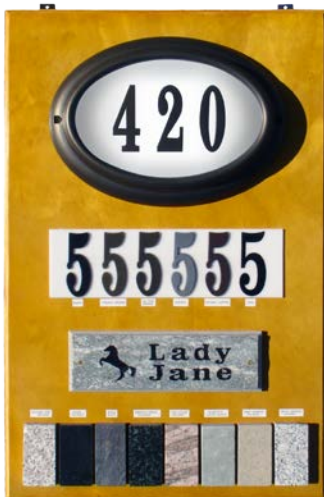
Edgewood/Granite Wall Display (#DISP-COMBO-W)