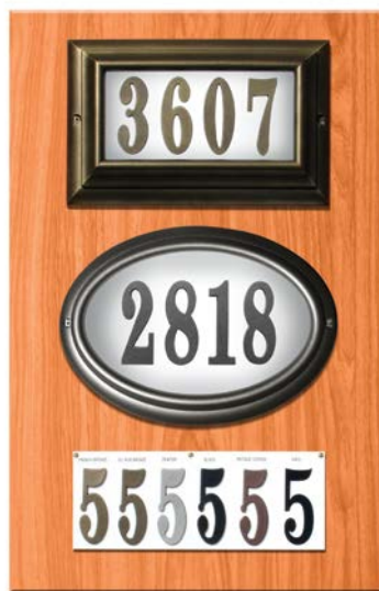
Edgewood Wall Display (#DISP-ED-W: $100 value)