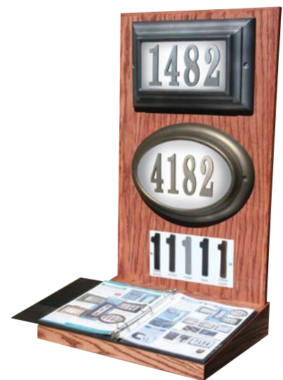
Edgewood Counter Display (#DISP-ED-C: $125 value)

* The cost of the display (excluding shipping) will be credited to your company in the form of a credit memo once you have purchased the value of the display in QualArc products.