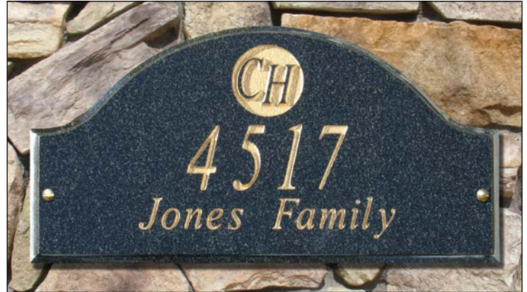
Ridgecrest Arch (15" x 7.75"): Shown in Black Polished; with optional custom logo.