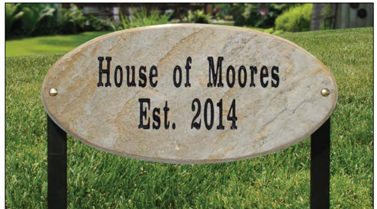
Rockport Oval (15" x 7"): Shown in Quartzite; with optional aluminum lawn stakes (LS-4718), 1" wide by 18" long, black.