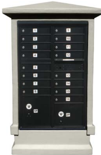
16 Patron Box, Type III (CBU-16-EVMC-SHRT)