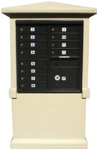
12 Patron Box, Type II (CBU-12-EVMC-TALL)