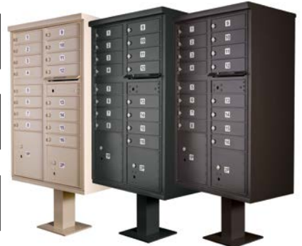
Sandstone Black Dark Bronze

QualArc 11300 Trade Center Dr., Ste. A Rancho Cordova, CA 95742