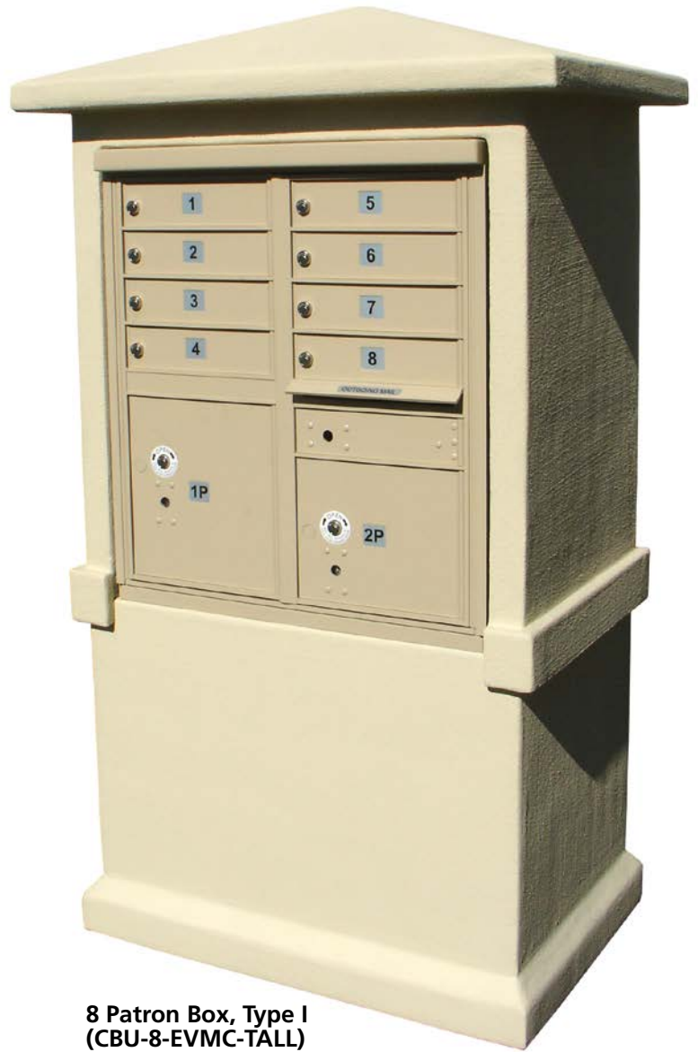
8 Patron Box, Type I (CBU-8-EVMC-TALL)

Our columns can be ordered with a CBU mailbox and pedestal, or you can supply your own. The column will fit most "F" spec CBU mailbox units that are mounted on a level pad. CBU mailbox color choices are: black, bronze, sandstone, white, green or gray (gray requires USPS approval). Local USPS approval is recommended.