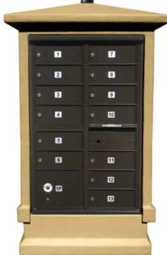
13 Patron Box, Type IV (CBU-13-EVMC-SHRT)