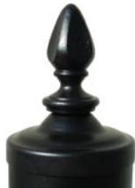
#5 Flat with Flame