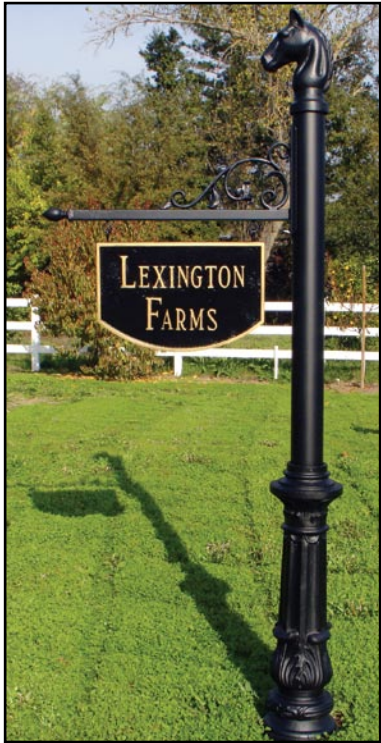
SNPST-701 Large Hanging Sign: Sign 15-1/2" x 10-1/4" Pole height 5' 4".