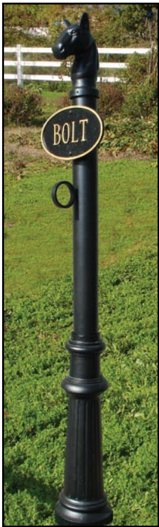
HIPST-801-AD4SM Hitching Post: Customize with horse's name.