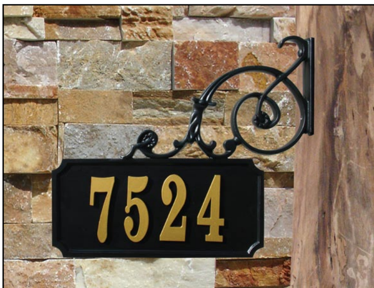
HNGREC Hanging Scroll Address Plaque: Attach to any wood surface. Plaque 13" x 6" (4" #'s).