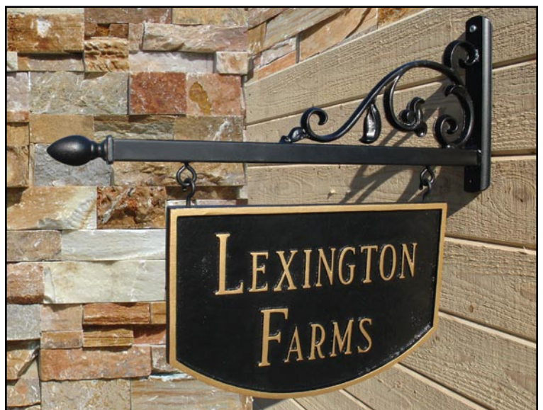
BRNSGN-TSP1 Double Sided Hanging Barn Sign with Scroll Arm: Sign 15-1/2" x 10-1/4". Overall 23-1/2" x 21-1/2" x 2".