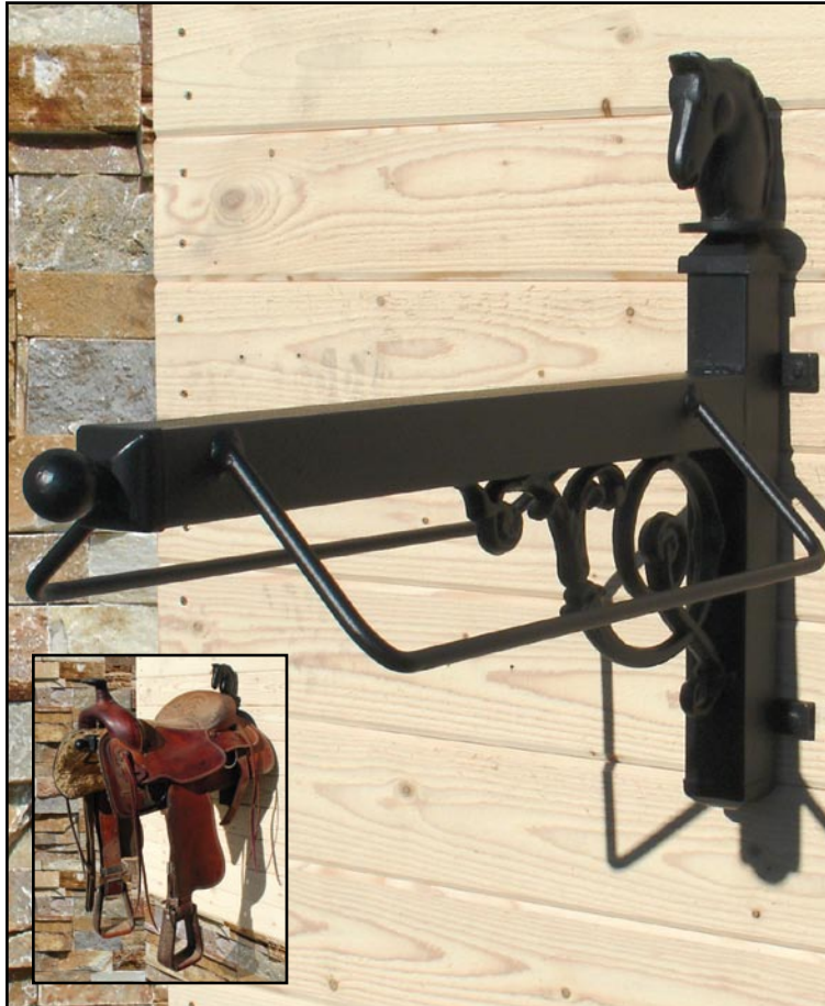
SDLRCK-HRS1 Saddle Rack, single. 28-1/2" x 22" x 11". SDLRCK-HRS3 Saddle Rack, triple. 28-1/2" x 72" x 11".

Prolong the life of your saddles and tack by storing them on horse saddle and tack racks. Feature cast aluminum and steel construction with a tough powder coat black finish.