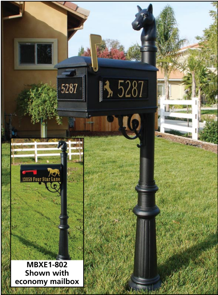
MBXE1-802 Shown with economy mailbox