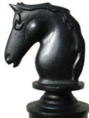
#2 Small Horsehead