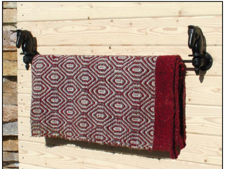
BLBAR-HRS 36" Blanket Bar with horse holders. 41" x 8-1/2" x 8".