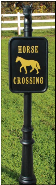
RSPST-12X18-801 12"x18" Sign: Sign frame holds your message.