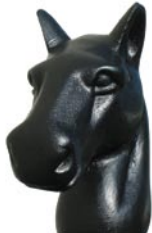
#1 Large Horsehead