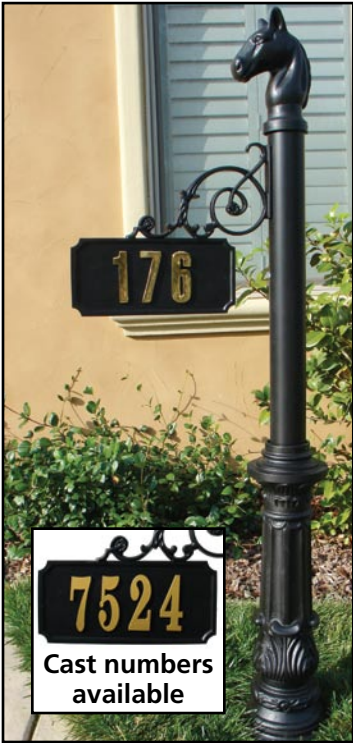
7524 Cast numbers available

Our Equestrian Collection is made from durable, rust-free aluminum with weather resistant finishes to last a lifetime. Mix-and-match posts and finials to create a unique combination. Please see our website for more options.