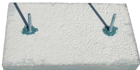
(special order, additional cost)