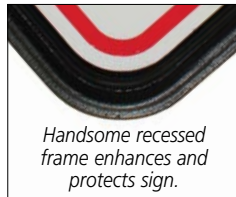
Handsome recessed frame enhances and protects sign.