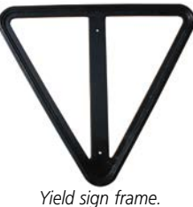
Yield sign frame.