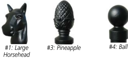
#1: Large Horsehead